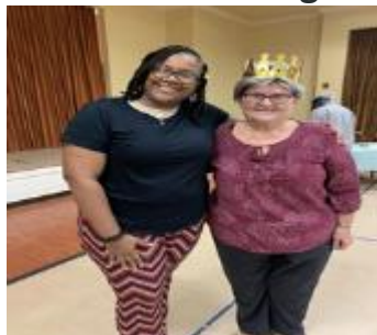
People's Vote Winner!