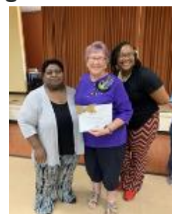
1 st Place Winner!