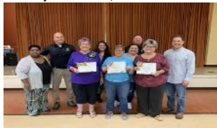
Winners and Judges!