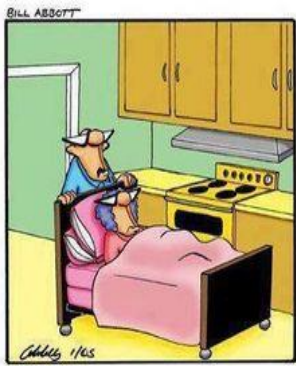
"I figured you should have breakfast in bed on your birthday. Can you reach the stove okay?"