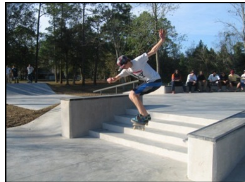
IG Levy Skate Park