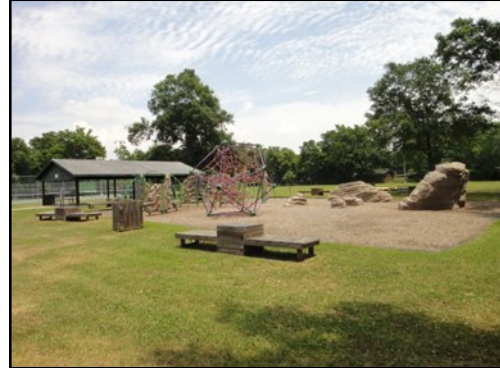
Pine St. Park: Playground, Walking Trail, Tennis Courts, Pavilion