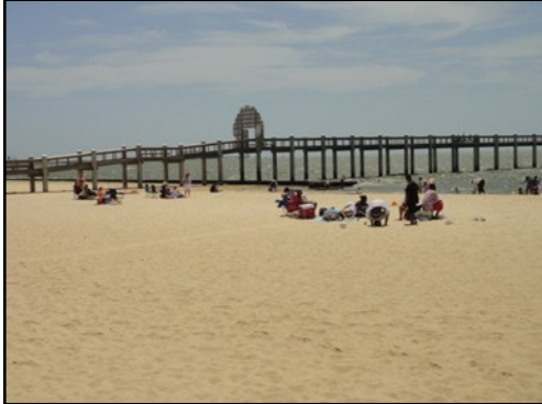
Beach Park: Playground, Pavilions, Fishing, Swimming, Walking Trail, Splash Pad

June is National Great Outdoors Month with June 11 th designated as Get Outdoors or GO Day. This is a time for individuals, families, communities, and the nation to celebrate the many benefits of getting outdoors and getting active. Pascagoula offers many ways to get outside and have fun. We have fishing, boating, swimming, skating, walking/running, and various sports. Look below and also check out our online activity guide to find out how you can "Get Outdoors"!