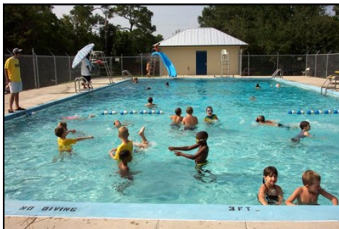
Andrew Johnson Swimming Pool