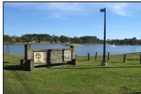
Whitehead Lake at IG Levy North: Walking Trail, Fishing